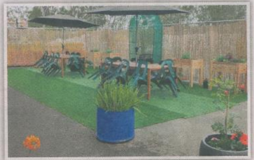
The finished product at the MRF site.