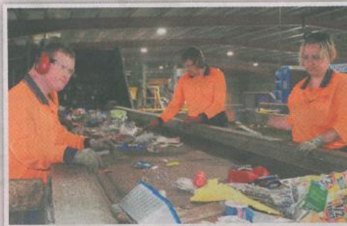
Workers at the MRF in Gatton sort through over 3,000 tonnes of recycling each year.