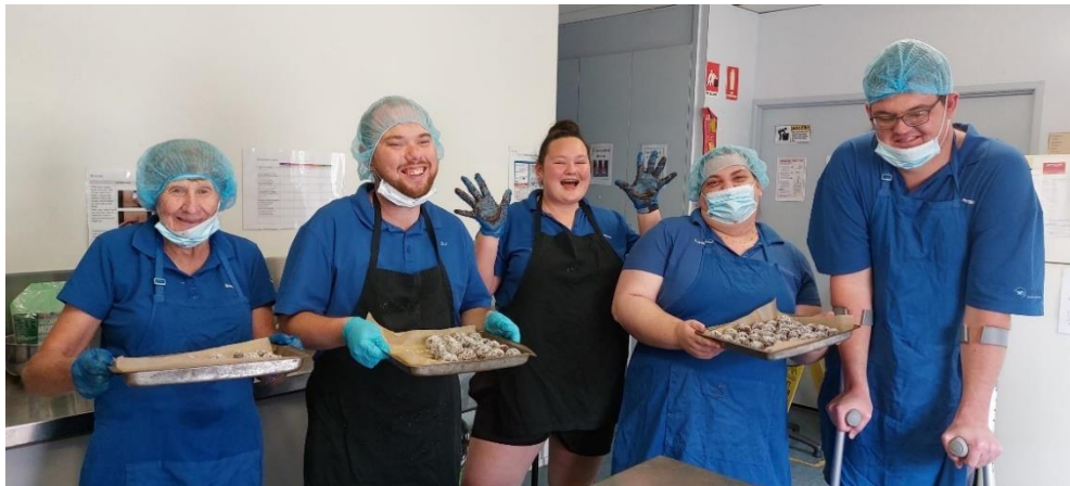
Loads of rumballs ready for Christmas

Kitchen staff have not only been cooking up their usual jams and chutney's but have also been preparing special Christmas gift packs. They have also catered for some Anuha events such as morning tea for the MRF lunch area working bee and putting on a pizza day for East Street staff.