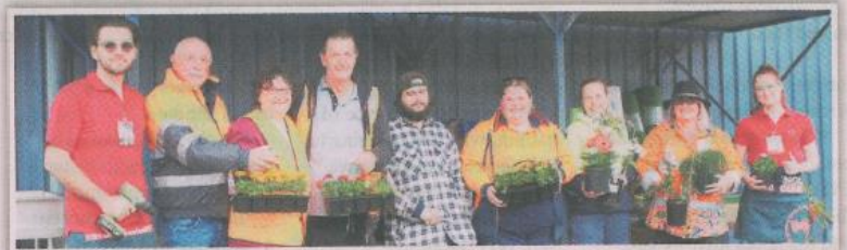
Plainland Bunnings staff, Anuha support workers and members of the Peace Lutheran Church of Gatton worked together to create an outdoor shelter and garden for MRF workers.

Paech said their clients deserved the best.