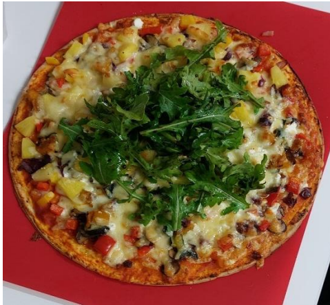
One of the many delicious pizzas created by the team

It has been bustling in the kitchen! The team have been preparing special Christmas orders of rum balls, white Christmas, fruit cake and rocky road for staff. These items have proved very popular!