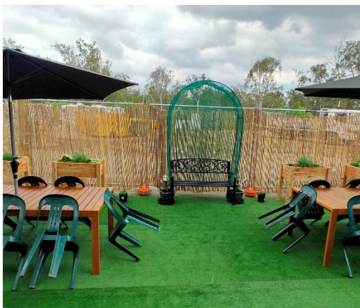
After photos of the MRF lunch area