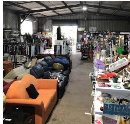
Find yourself a bargain

It has been a busy time at the tip shop. Staff and volunteers have done a great job of cleaning up the gardens at the front of the shop.