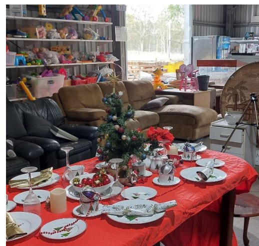
All the Christmas trimmings