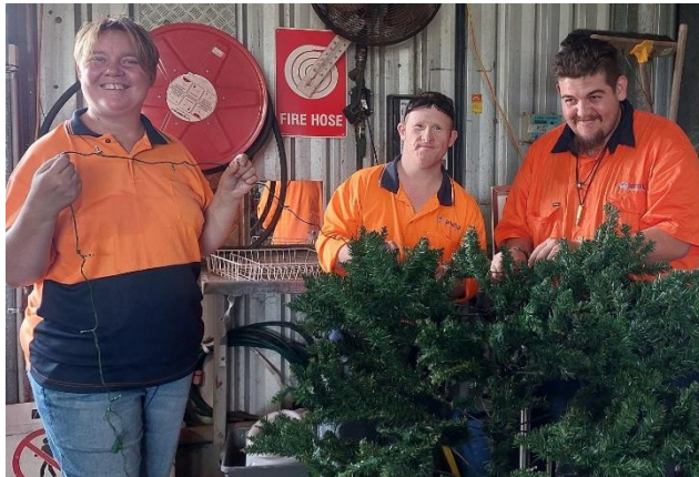
The team setting up Christmas trees